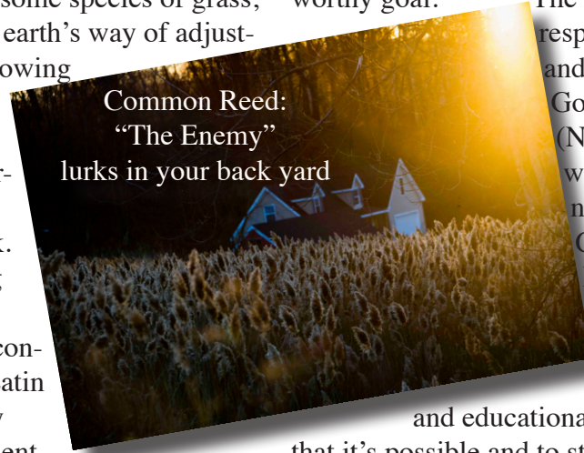
Common Reed: "The Enemy" lurks in your back yard

If the nature Conservancy had not taken control of the property it is likely that the sand would have been trucked off to construction sites all over the northeast and the whole thing would turn into a housing development when the upstate economy booms next. Hey, It's possible. Setting land aside, to be protected from development seems like a worthy goal.