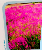
Purple loosestrife million seeds a year invasive plant a big problem.

Invasive species move by air, land and water. They are spread on purpose and by chance by animals and people.