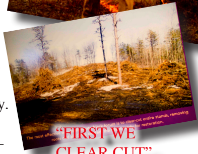
"FIRST WE CLEAR CUT"

"footprint," ( http://www.nature.org/initiatives/climatechange/calculator/ ) and try to play along by entering in the carbon footprint of their plant killing spree.